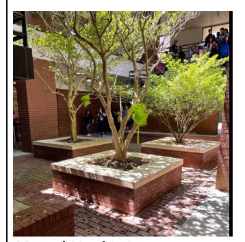
Mental Health Awareness Week

Rock Hill High School faculty and staff is facilitating the process for all students to develop the World Class Skills for Profile of the South Carolina Graduate by setting high expectations through rigorous coursework in all content areas. Rock Hill High has provided students the opportunity to be creative in academics, the arts, athletics, extra-curricular activities, character development, and community involvement this past year. For more information on academic achievement, go to the SC Department of Education School Report cards at ed.sc.gov/data/report-cards.